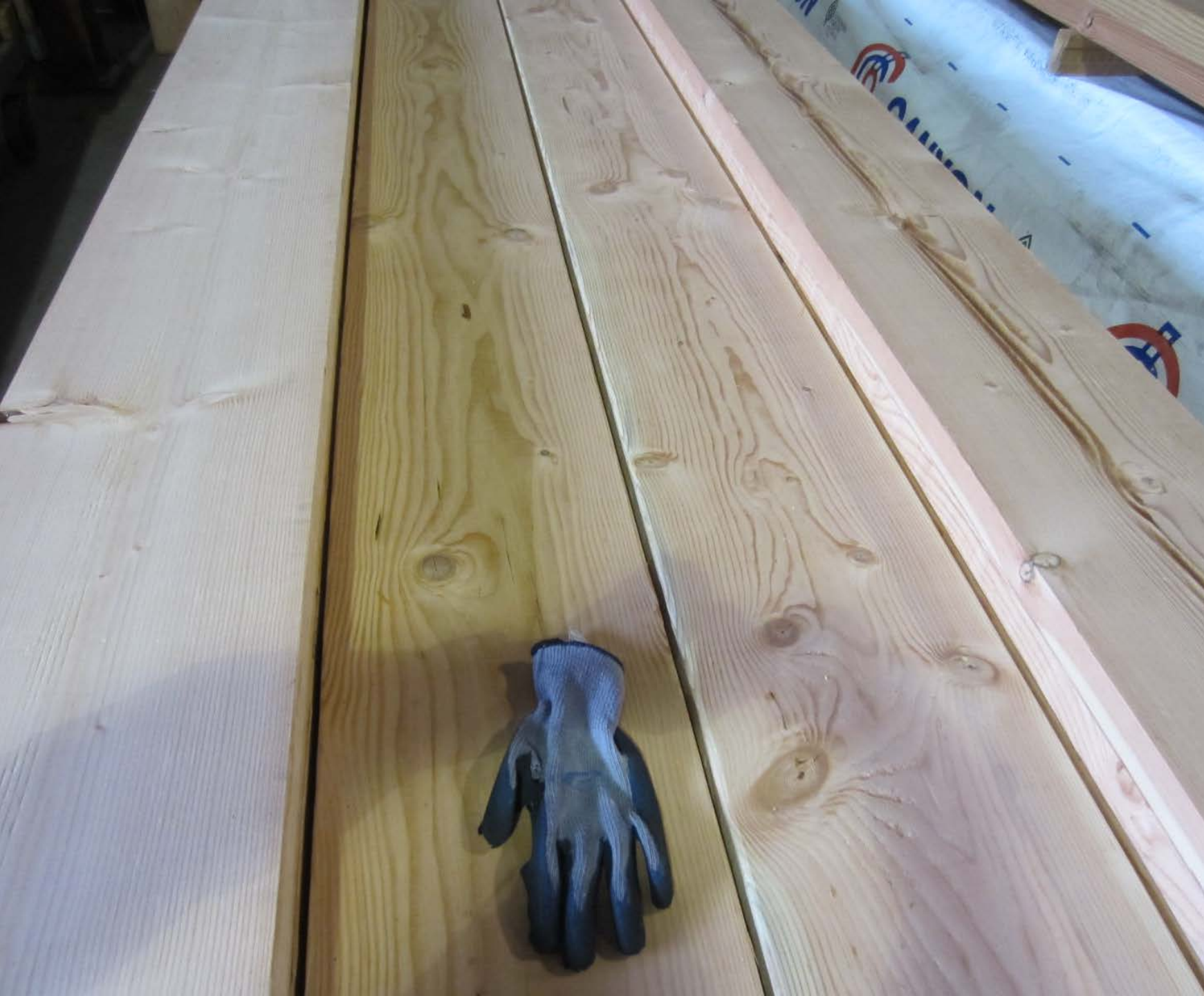
2x12 Select Structural Douglas Fir