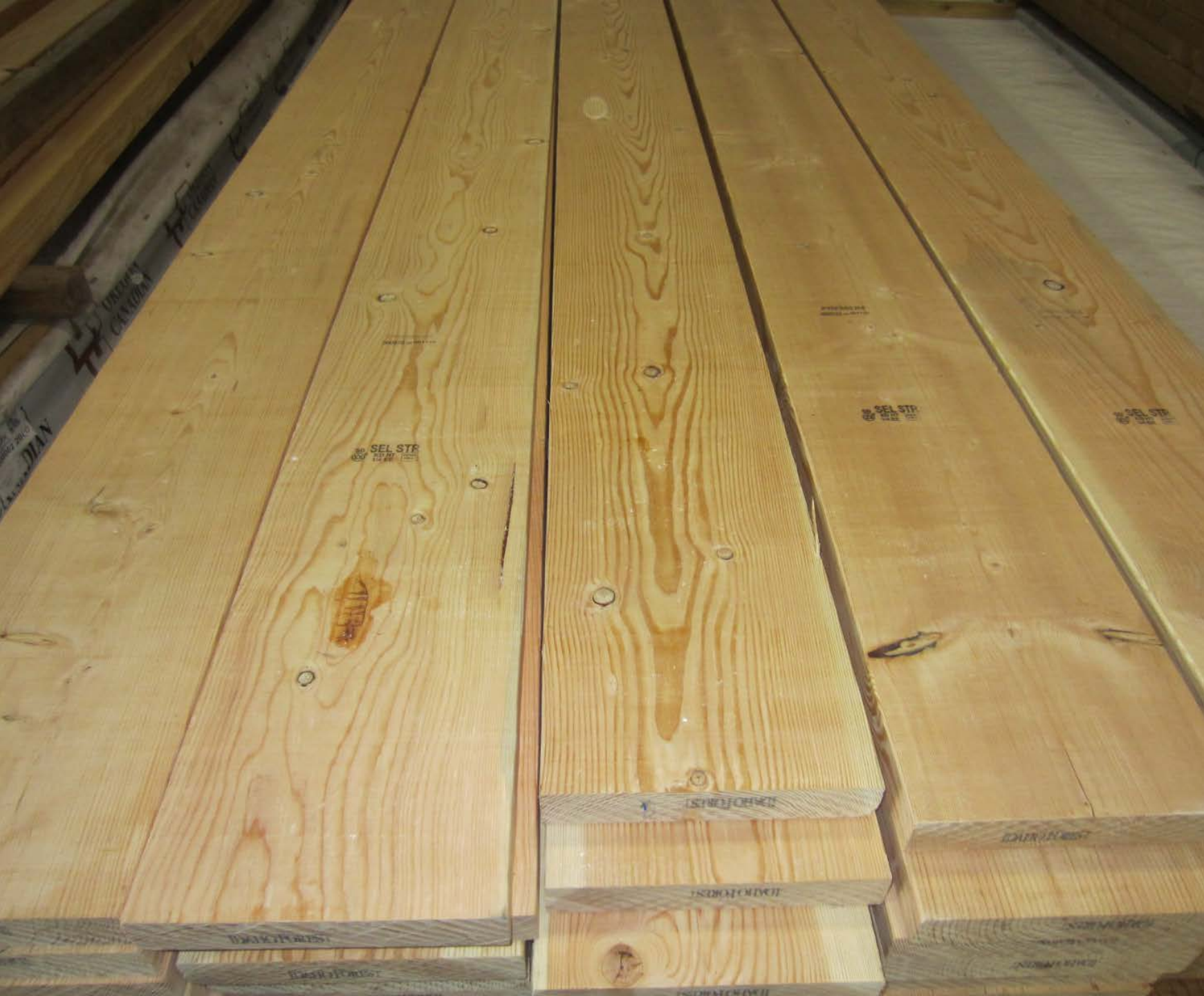
2x12 Select Structural Douglas Fir