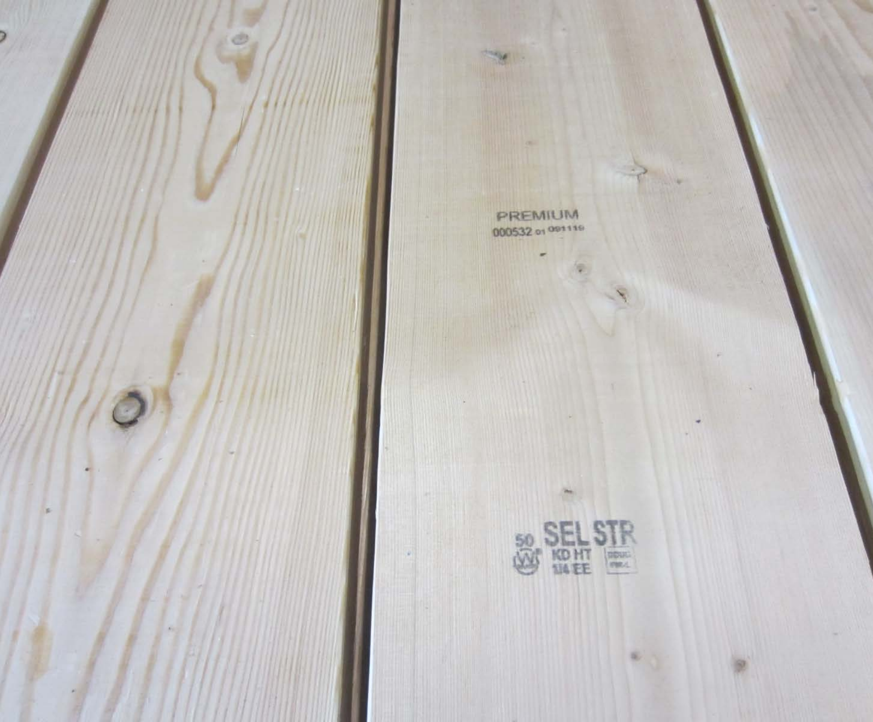
2x10 Select Structural Douglas fir