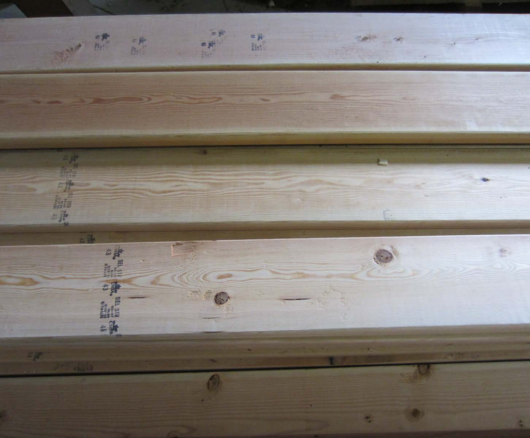
2x8 SelStruct Douglas Fir