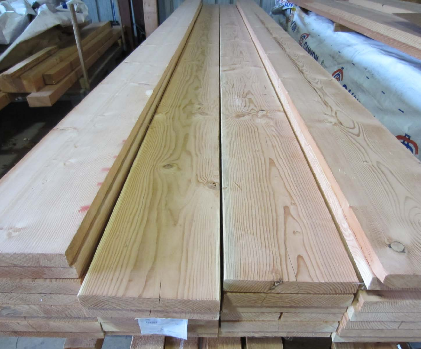
2x10 Select Structural Douglas Fir